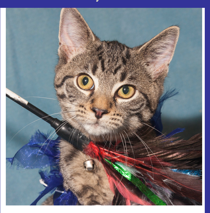
Appaloosa — Tabby/Tiger DSH Kitten "Sweet Little Girl!"

Sasha is a 1 1/2 year old, female, white-coated, Terrier mix. Sasha sweet, calm, friendly dog. She loves people and is eager to interact and learn. Sasha seems like a great family pet! Call 732-657-8086 to find out more.